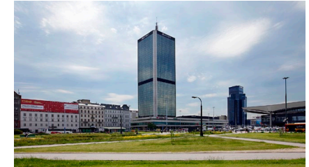
Equinix Warsaw (WA1) IBX data center