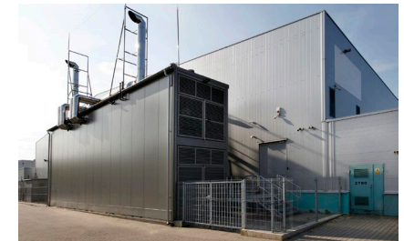
Equinix Warsaw (WA2) IBX data center