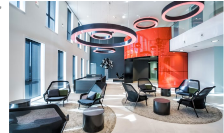
Equinix AM3 IBX data center customer area