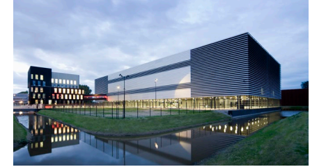
Equinix AM3 IBX data center exterior